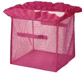
PE826627 KARISMATISK box, foldable 7,99 100% polyester. Designer: Zandra Rhodes. W33×D33, H33cm. Pink 404.990.83