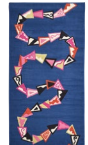
PE826653 KARISMATISK rug, low pile 14,99 100% nylon. Designer: Zandra Rhodes. W80×L150cm. Blue 004.991.41