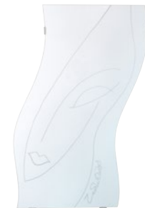
PE826646 KARISMATISK mirror 14,99 Mirror glass. Designer: Zandra Rhodes. W56×H80cm. 604.990.63