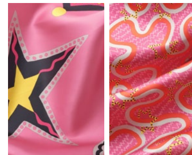
PE826648 KARISMATISK pre-cut fabric 24,99/2 pack. 100% polyester. Designer: Zandra Rhodes. W150×L300cm. Assorted patterns pink 404.992.00