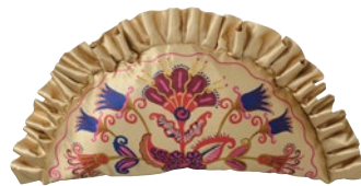
PE826634 KARISMATISK cushion 19,99 Cover: 100% polyester. Filling: polyester fibres. Designer: Zandra Rhodes. L58×W31cm. Floral pattern beige 404.991.44