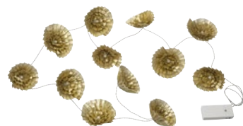
PE826645 KARISMATISK LED lighting chain with 12 lights, indoor, battery-operated 12,99 Plastic and 100% polyester. Designer: Zandra Rhodes. Total length 2.1m. Gold-colour 204.990.41