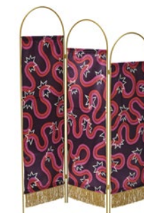
PE826649 KARISMATISK room divider 49,99 Powder coated steel and 100% polyester. Designer: Zandra Rhodes. W136×H160cm. Purple 704.990.48