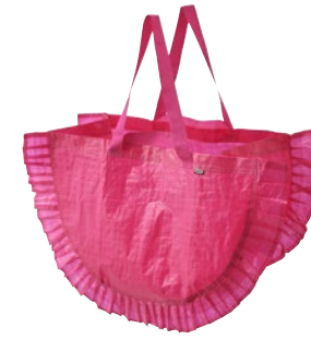
PE826631 KARISMATISK carrier bag, large 3,- Polypropylene plastic. Designer: Zandra Rhodes. W57×D36, H38cm. 60l. Pink 704.990.67