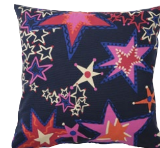
PE826641 KARISMATISK cushion cover 4,99 100% cotton. Designer: Zandra Rhodes. L50×W50cm. Star pattern blue 904.991.65