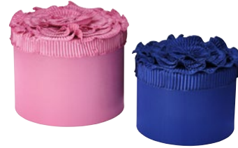
PE826628 KARISMATISK box, set of 2 17,99 Comprises: 1 box (Ø26, H20cm) and 1 box (Ø21, H16cm). Paper and 100% polyester. Designer: Zandra Rhodes. Blue/pink 504.990.87