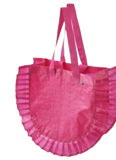
PE826632 KARISMATISK carrier bag, medium 2,- Polypropylene plastic. Designer: Zandra Rhodes. W38×D20, H36cm. 25l. Pink 505.038.57