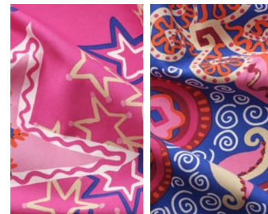
PE826647 KARISMATISK pre-cut fabric 24,99/2 pack. 100% cotton. Designer: Zandra Rhodes. W150×L300cm. Assorted patterns pink/blue 204.992.01