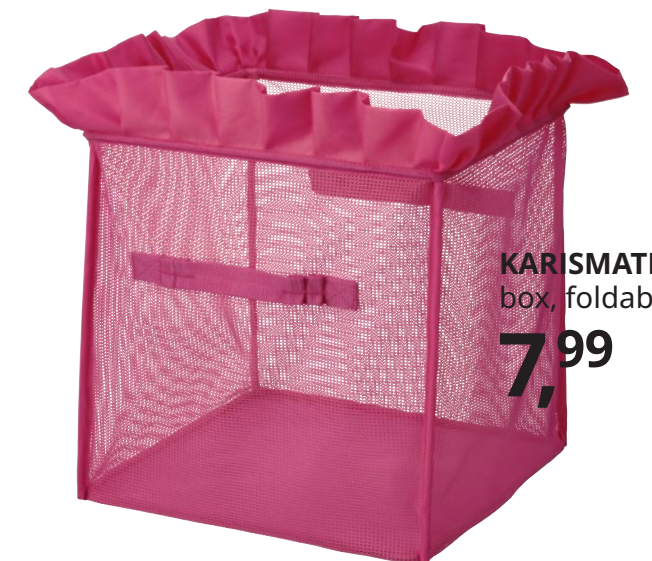
KARISMATISK box, foldable