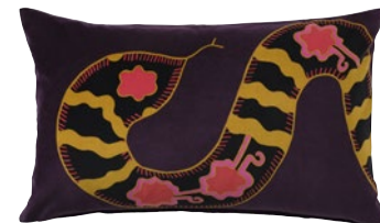
PE826638 KARISMATISK cushion cover 12,99 100% cotton. Designer: Zandra Rhodes. L65×W40cm. Snake pattern purple 604.991.62