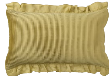
PE826636 KARISMATISK cushion cover 9,99 100% polyester. Designer: Zandra Rhodes. L65×W40cm. Gold-colour 704.915.56