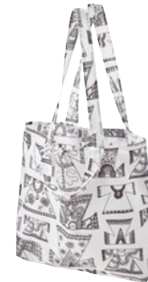
PE826630 KARISMATISK carrier bag 1,- 100% polyester. Designer: Zandra Rhodes. W45×H36cm. 15l. White/black 904.990.71