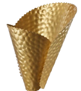
PE826644 KARISMATISK lampshade 20,- Powder coated steel. Designer: Zandra Rhodes. W19×H22cm. Gold-colour 304.990.26