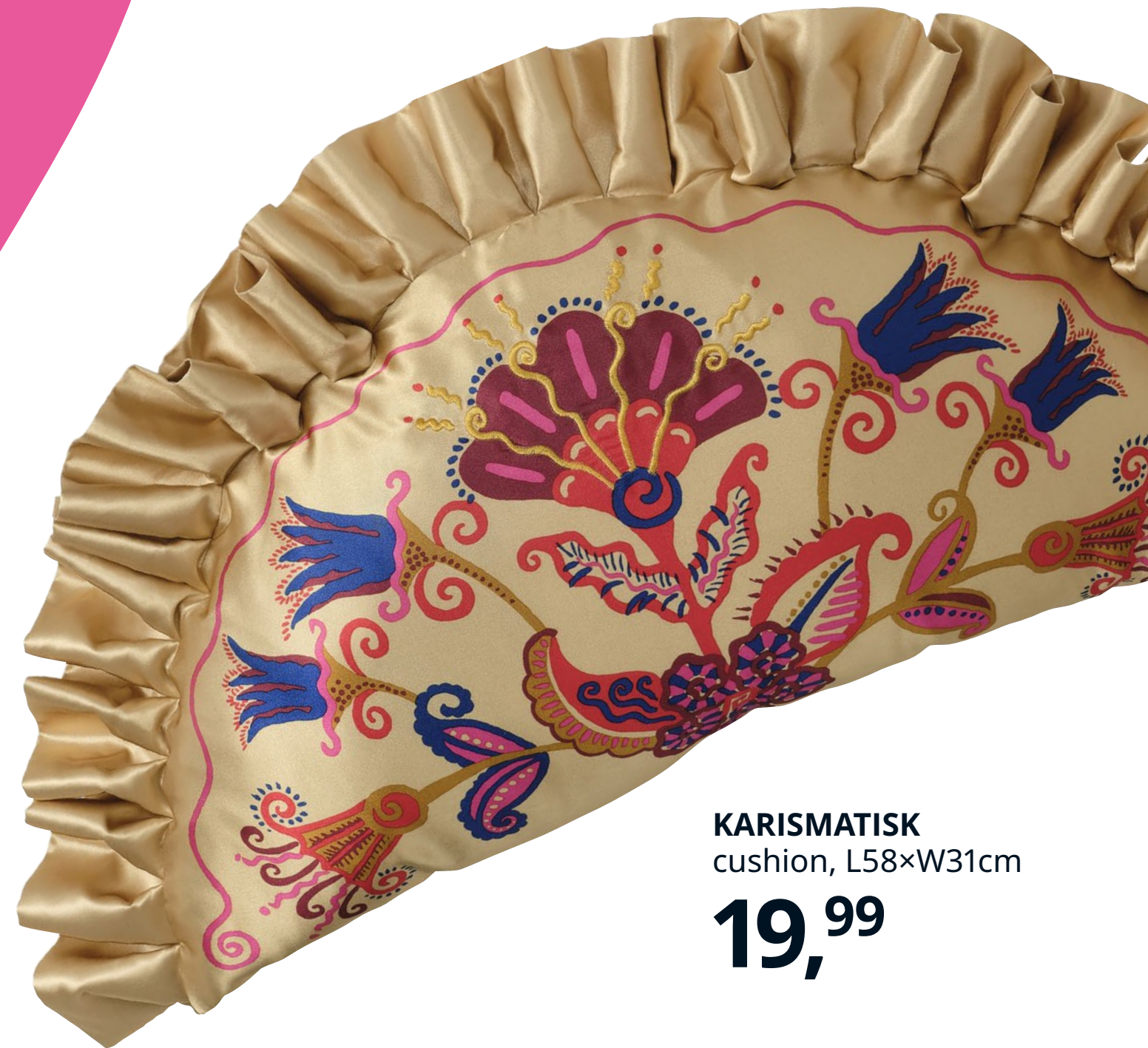
KARISMATISK cushion, L58×W31cm