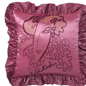
PE826639 KARISMATISK cushion cover 9,99 100% polyester. Designer: Zandra Rhodes. L50×W50cm. Pink 004.991.55